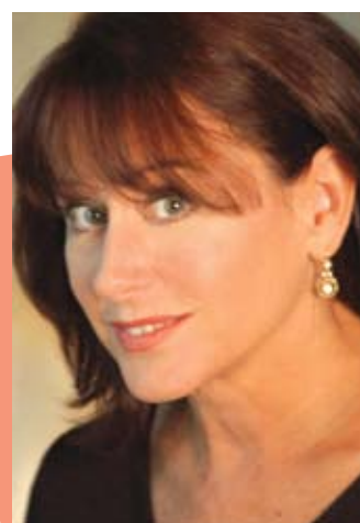
The Lady With All the Answers O'Reilly Theater November 13-December 14