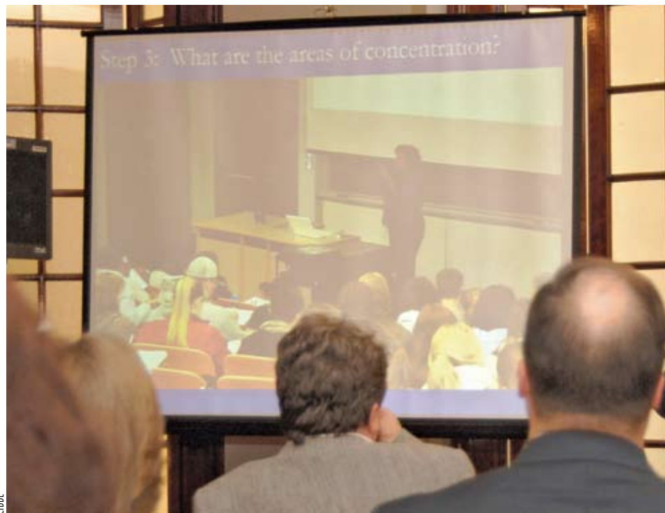
A scene from the 2007 Teaching Excellence Fair at Pitt