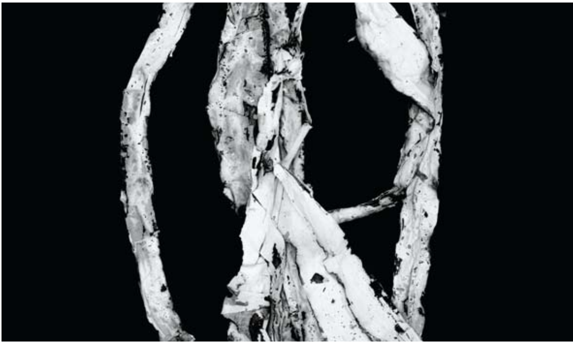
Figure 3 (still), 2008, Life on Mars , 55th Carnegie International, through January 11