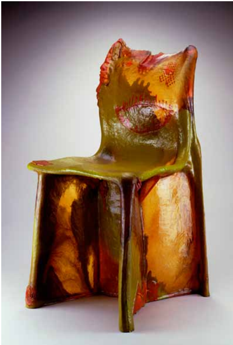
Pratt Chair No. 4 by Gaetano Pesce, Permanent Collection, Ailsa Mellon Bruce Galleries, Carnegie Museum of Art, ongoing

dinosaur fossils, Jan. 12-28 , Pitt Department of Studio Arts, University Honors College, 412-648-2430.