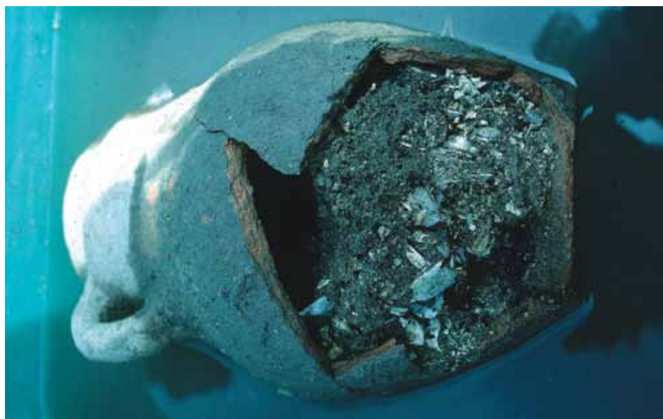
Burial urns such as this one contained calcined bones mixed with sediment that seeped in as the water table rose over the millennia.