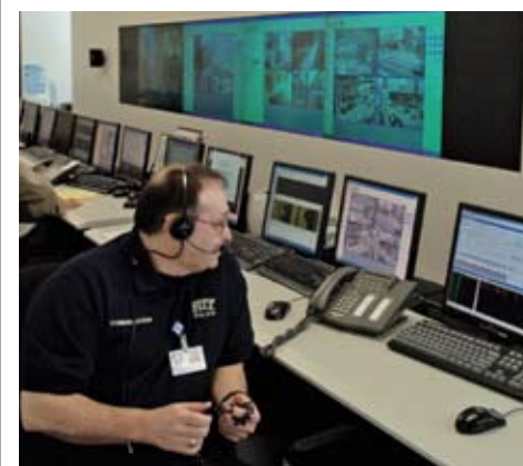
The new Public Safety Building's command center