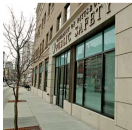
Public Safety Building at 3412 Forbes Ave.

The Police Department's areas feature a state-of-the-art campuswide security monitoring and command center with three dispatch desks and a bank of four 52-inch video screens that can be configured in multiple ways to display security camera video, dispatch and call screens, and weather information. The system is fully integrated