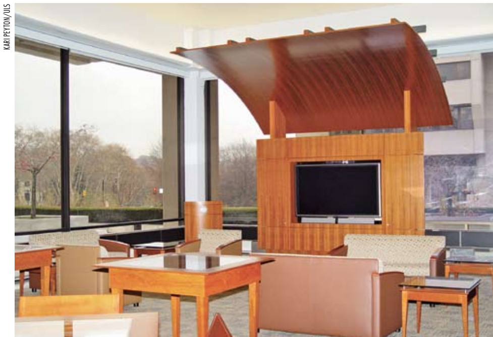
The Dick Thornburgh Room in Hillman Library