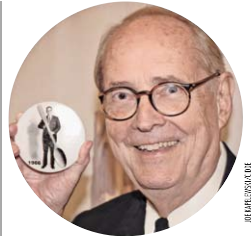
Dick Thornburgh (LAW '57) displays a souvenir from his first, unsuccessful run for public office. Campaigning in 1966 as a Republican candidate for the U.S. Congress, he promised to "stir things up" if elected.