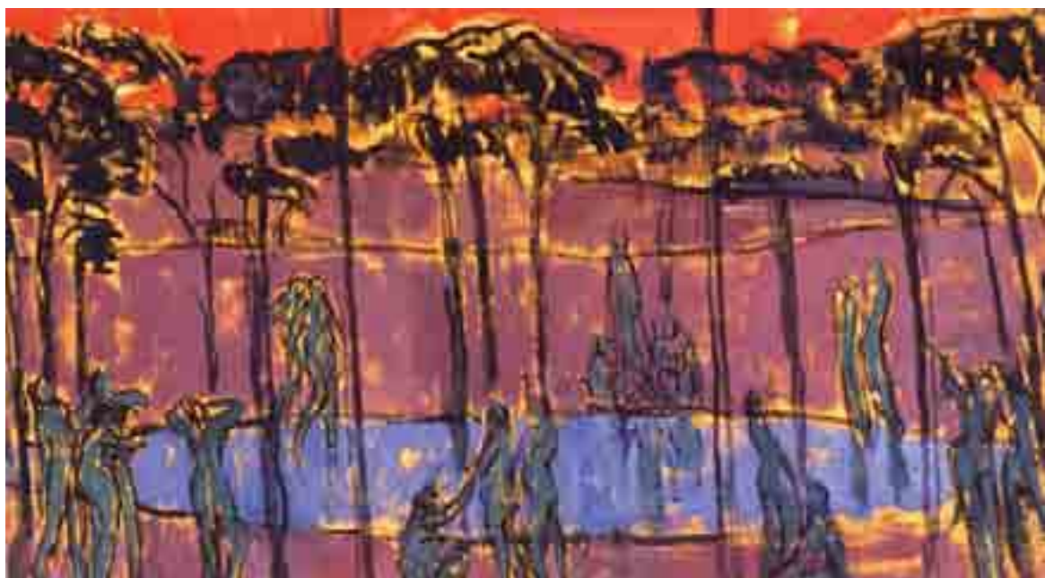
"Design for a screen" by Venessa Bell, Carnegie Museum of Art, through May 18