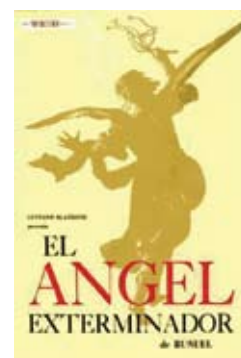
El Angel Exterminador Frick Fine Arts Auditorium,

Chinese New Year Celebration William Pitt Union, February 7