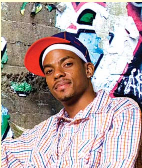
Jerome White Jr.

Pitt alumnus Jerome White Jr., Japan's pop sensation better known as "Jero," was named Best New Artist at the 50th Annual Japan Record Awards—the Japanese equivalent of the Grammy Awards.