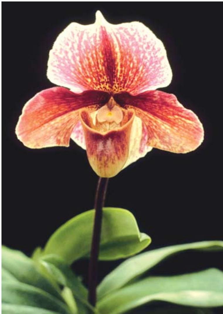
Annual Orchid Show Phipps Conservatory and Botanical Gardens, through March 8