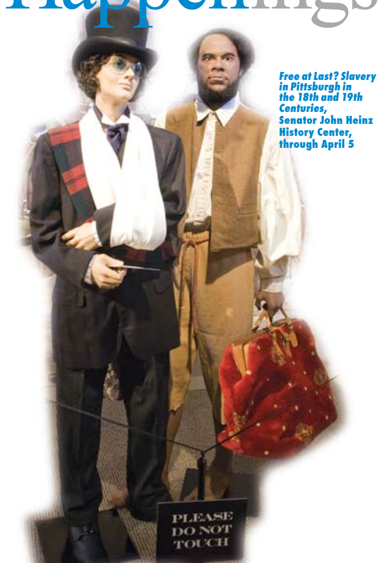
Free at Last? Slavery in Pittsburgh in the 18th and 19th Centuries, Senator John Heinz History Center, through April 5

losis Institute, 412-624-1895, to register visit www.pamaaetc.org/events.asp .