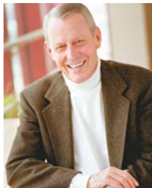
Thomas E. Starzl

Starzl is a Distinguished Service Professor of Surgery in the University of Pittsburgh School of Medicine and director emeritus of the Thomas E. Starzl Transplantation Institute at the University of Pittsburgh Medical Center (UPMC). He achieved international acclaim by laying the groundwork for the transplantation field of medicine. Today, the Thomas E. Starzl Transplantation Institute remains the world leader in transplantation experience, with more than 10,000 patients treated to date.