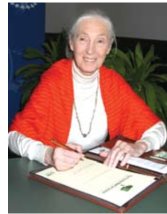
Jane Goodall Heinz Hall March 25