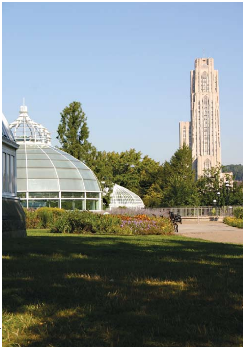
Phipps Conservatory with Pitt's Cathedral of Learning in the background

Pitt, CMU, and UPMC will host the 12 science and technology tours Sept. 21. The tours will help explain how and why