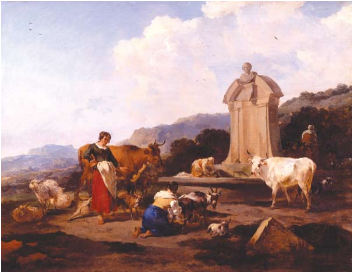
Frick Art and Historical Center, The Dutch Italianates: Seventeenth-Century Masterpieces From Dulwich Picture Gallery, London, through September 20