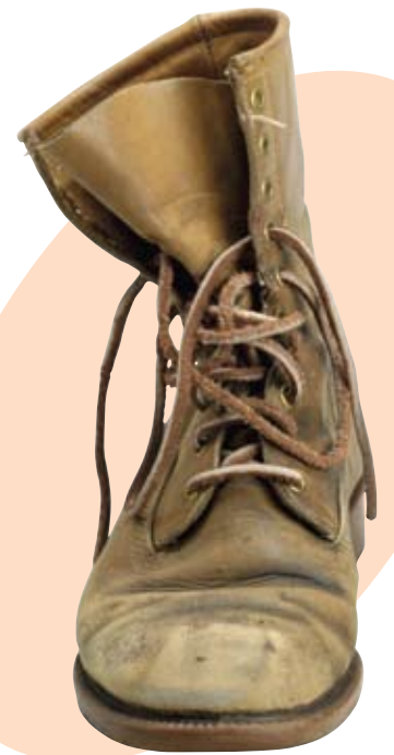
STOMP, Benedum Center, September 15-20

Faustus , raucous reenactment of myth of Faust, Sept. 8-12 , Kelly-Strayhorn Performing Arts Center, 5941 Penn Ave., East Liberty, 412-363-3000, www.kelly-strayhorn.org.