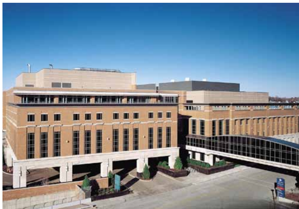
Hillman Cancer Center (UPCI)