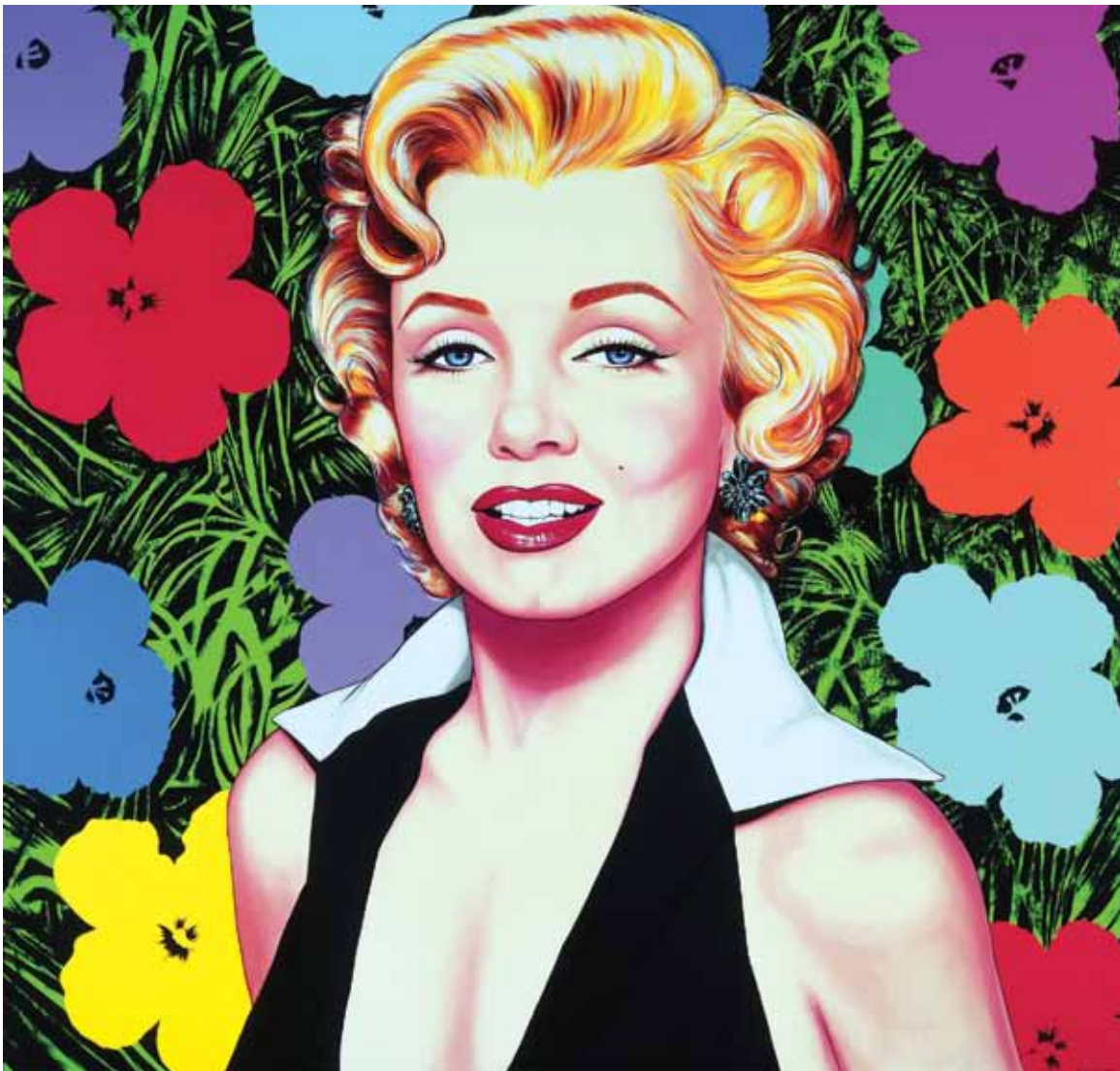
En el jardín de Hollywood, 2003, by © Antonio de Felipe, Marilyn Monroe: Life as a Legend, The Andy Warhol Museum, through January 2