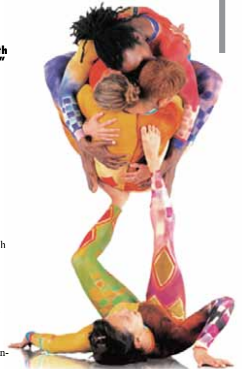
Pilobolus, Byham Theater, October 30