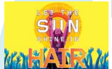
Hair, Heinz Hall, February 15-17

Hair , New York Public Theater's new Tony-winning production, Feb. 15-17 , Heinz Hall, 600 Penn Ave., Downtown, PNC Broadway Across America, www.pgharts.org, 412-456-6666, PITT ARTS Cheap Seats, 412-624-4498, www.pittarts.pitt.edu.