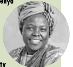
Wangari Muta Maathai

2004 Wangari Muta Maathai , who earned the Master of Science degree in biology at Pitt in 1965, is awarded the Nobel Peace Prize for her 30-year effort to reforest her native Kenya and improve the economic status of women there, while fighting for democracy and against corruption and tribalism. Pitt conferred on Maathai an honorary Doctor of Public Service degree during an Oct. 26, 2006, ceremony in Alumni Hall.