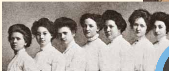
Pi Theta Nu, 1909