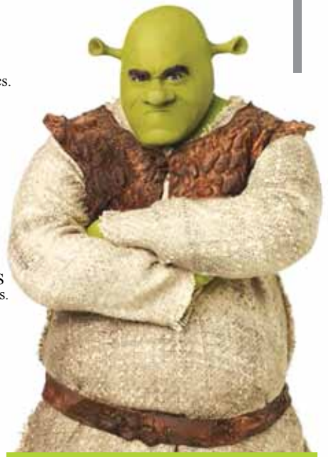
Shrek The Musical, Benedum Center, March 15-20