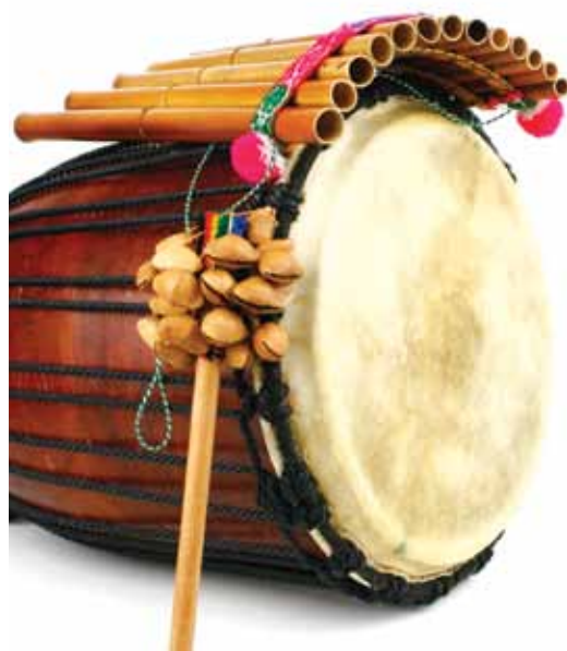
Tribute Concert: A Symphonic Celebration of African American Culture, Pittsburgh Symphony Orchestra, Heinz Hall, March 18

Heinz History Center, America's Best Weekly: A Century of The Pittsburgh Courier , through Oct. 2 , 1212 Smallman St., Strip District, 412-454-6000, www.heinzhistorycenter.org.