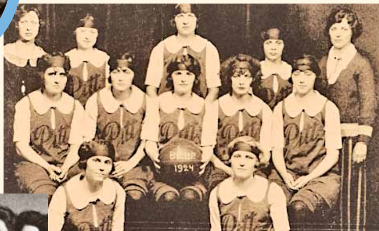
Pitt's 1924 women's basketball team