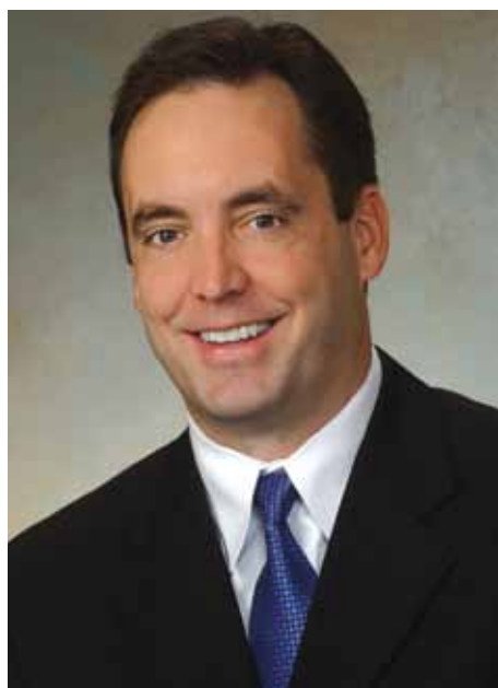
Senator Jake Corman

The Senate Appropriations Committee is traveling to the campuses of the four state-related universities—Pitt, Penn State, Temple, and Lincoln—during September