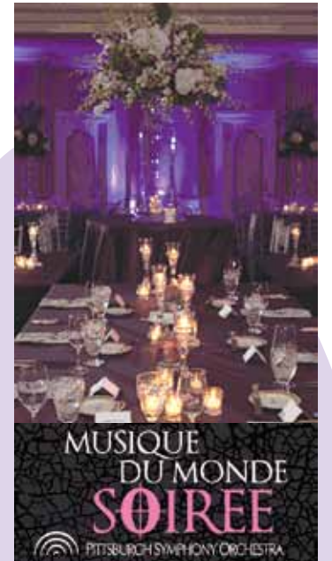
Musique du Monde: A World of Music With Anne-Sophie Mutter, Pittsburgh Symphony Orchestra, Heinz Hall, September 17