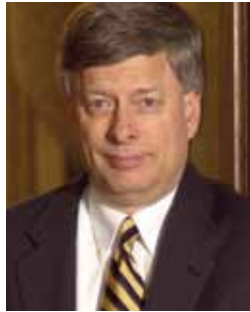
Mark A. Nordenberg

Pitt and the other state-related institutions mounted a campaign to restore a significant amount of the funding slated for elimination in the initial proposed budget. The final budget for the fiscal year that began July 1 cut Pitt's E&G appropriation by 19 percent and its academic medical lines by 50 percent. In all, Pitt's total reduction amounted to more than $40 million, a cut of 22 percent.