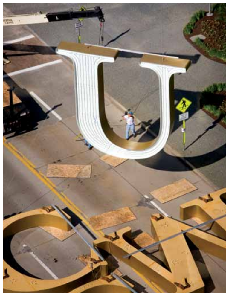
Lifting Letters by Renee Rosensteel

Picturing the City: Downtown Pittsburgh, 2007-2010, Carnegie Museum of Art, through March 26