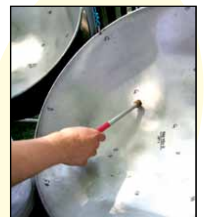
Resonance Percussion, Nurdy's Café, October 5