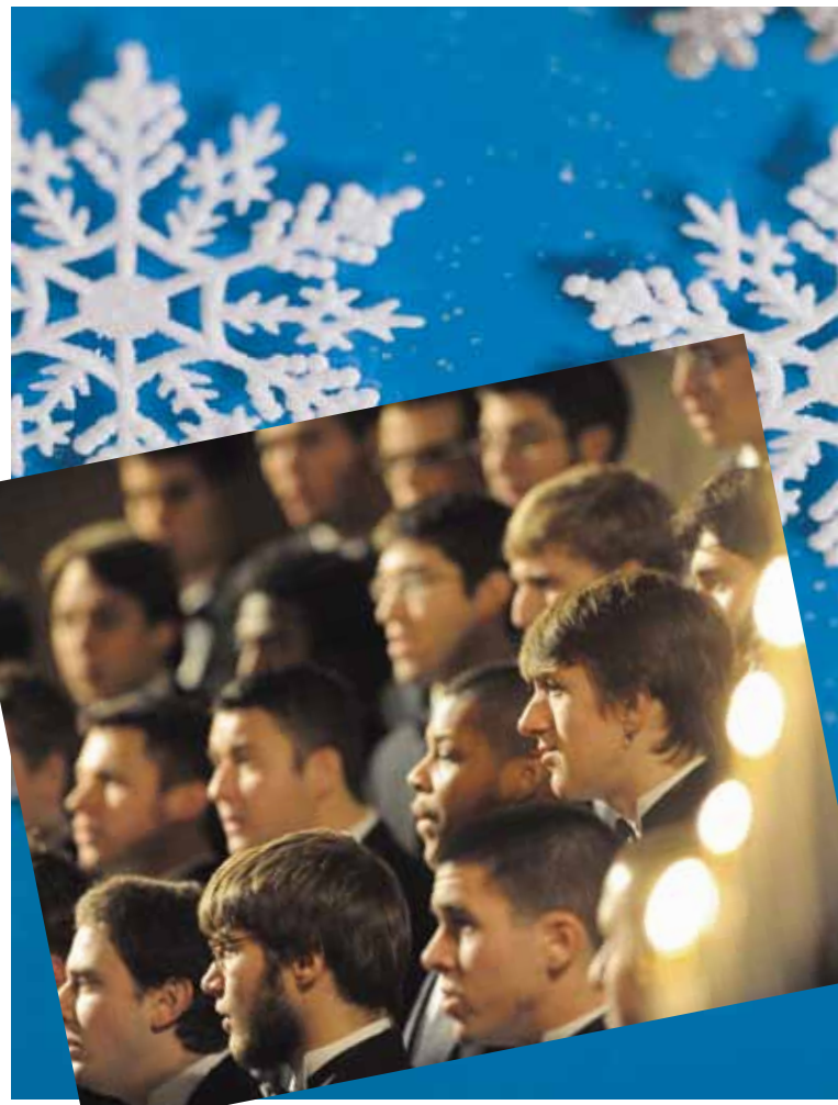
Pitt Men's Glee Club Holiday Concert, First Baptist Church of Pittsburgh, December 10