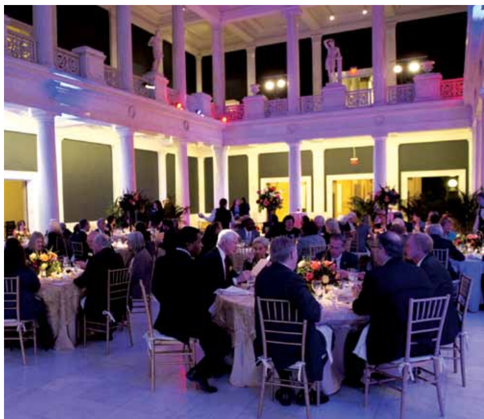
Brackenridge Circle dinner in Carnegie Museum of Art's Hall of Sculpture