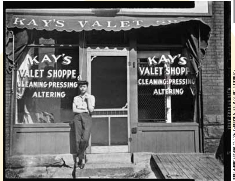
Teenie Harris, Photographer: An American Story , Carnegie Museum of Art through April 7

Anthropology in the Era of Globalization: Ethnography, Ethnology, and Comparative Analysis , daylong conference marking 50 years of anthropological research, teaching, and graduate training at Pitt, 9 a.m.-6 p.m. followed by 6-9 p.m. reception Dec. 9 , keynote address by Sidney Mintz, Johns Hopkins University anthropology professor, events held at Posvar Hall and Frick Fine Arts Building,