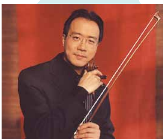
Yo-Yo Ma with the PSO, Heinz Hall, December 6

Pittsburgh Jazz Orchestra: Holiday Performance , holiday classics receive a jazz makeover, 6 p.m. Dec. 18 , August Wilson Center, 980 Liberty Ave., Downtown, August Wilson Center for African American Culture, www.augustwilsoncenter.org , PITT ARTS Cheap Seats Program, 412-624-4498, www.pittarts.pitt.edu .