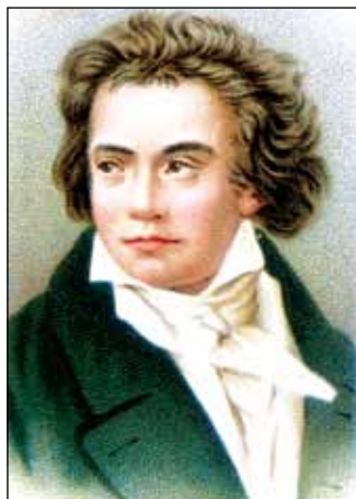
Beethoven, Mozart, & Respighi, Pittsburgh Symphony Orchestra, Heinz Hall, February 10 and 12

The Frick Art & Historical Center , Draw Me a Story: A Century of Children's Book Illustration , survey of drawing styles and techniques spanning more than 100 years, including detailed watercolors, expressive pen drawings, and experimental combinations from