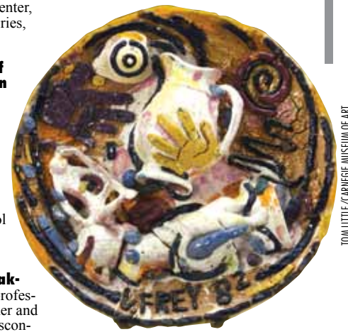
Platte, 1982 by Viola Frey

Classical Indian Dance National Competition 2012 , hosted by Pitt's classical Indian dance team, Nrityamala, which won the 2011 classic, 6 p.m.