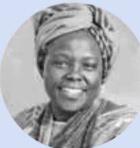
Wangari Muta Maathai