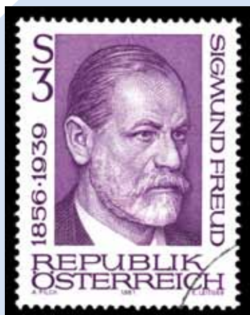
Freud's Last Session, O'Reilly Theater, through April 1

Carnegie Museum of Art , Teenie Harris. Photographer: An American Story , through April 7 ; Maya Lin , imaginative recreations of natural forms transformed into objects of contemplation, through May 13 ; Hand Made: Contemporary Craft in Ceramic, Glass, and Wood , ongoing , 4400 Forbes Ave., Oakland, 412-622-3131, www.cmoa.org.