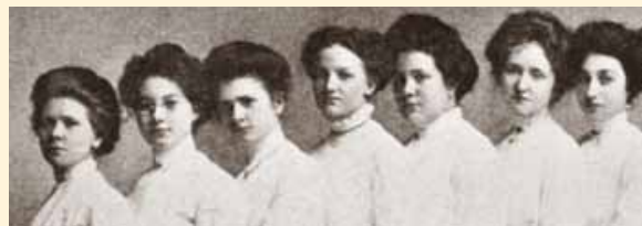
Pi Theta Nu, 1909

1908 Pi Theta Nu , the first sorority, forms in 1908. Women's organizations are rare until after 1910.