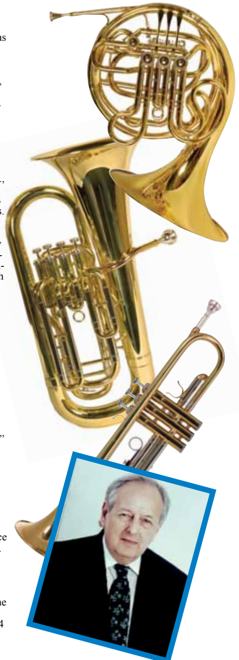
Haydn, Previn, and Mendelssohn's "Italian," Heinz Hall, March 9-11