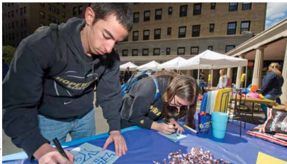
During Spring Fair 2012, Pitt students signed thank-you cards for the University's police officers as well as for the bomb-sniffing dogs used to search buildings during threats. The fair was held April 12 in Schenley Quadrangle.

Pitt's Student Government Board (SGB) has initiated two campuswide campaigns: "Keep Calm and Hail to Pitt" and "See Something, Say Something," designed to help empower students to report suspicious