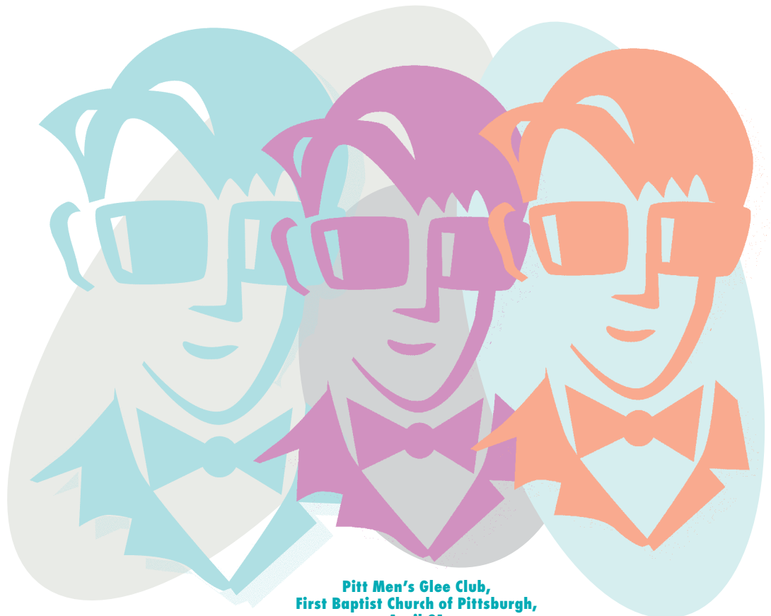
Pitt Men's Glee Club, First Baptist Church of Pittsburgh, April 21

The Abduction From the Seraglio , Mozart opera about the adventures of a