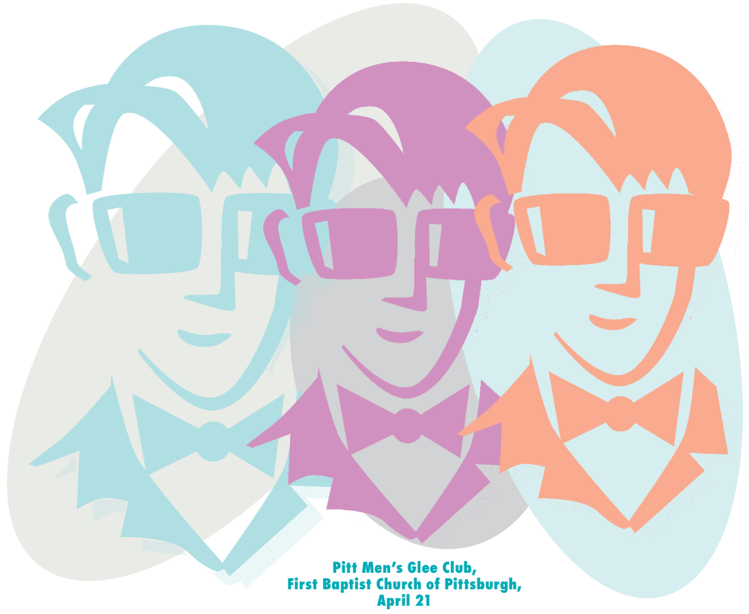
Pitt Men's Glee Club, First Baptist Church of Pittsburgh, April 21

The Abduction From the Seraglio, Mozart opera about the adventures of a