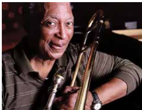
Jimmy Owens (above) and Curtis Fuller

soloist, bandleader, and composer of orchestral compositions and film scores.