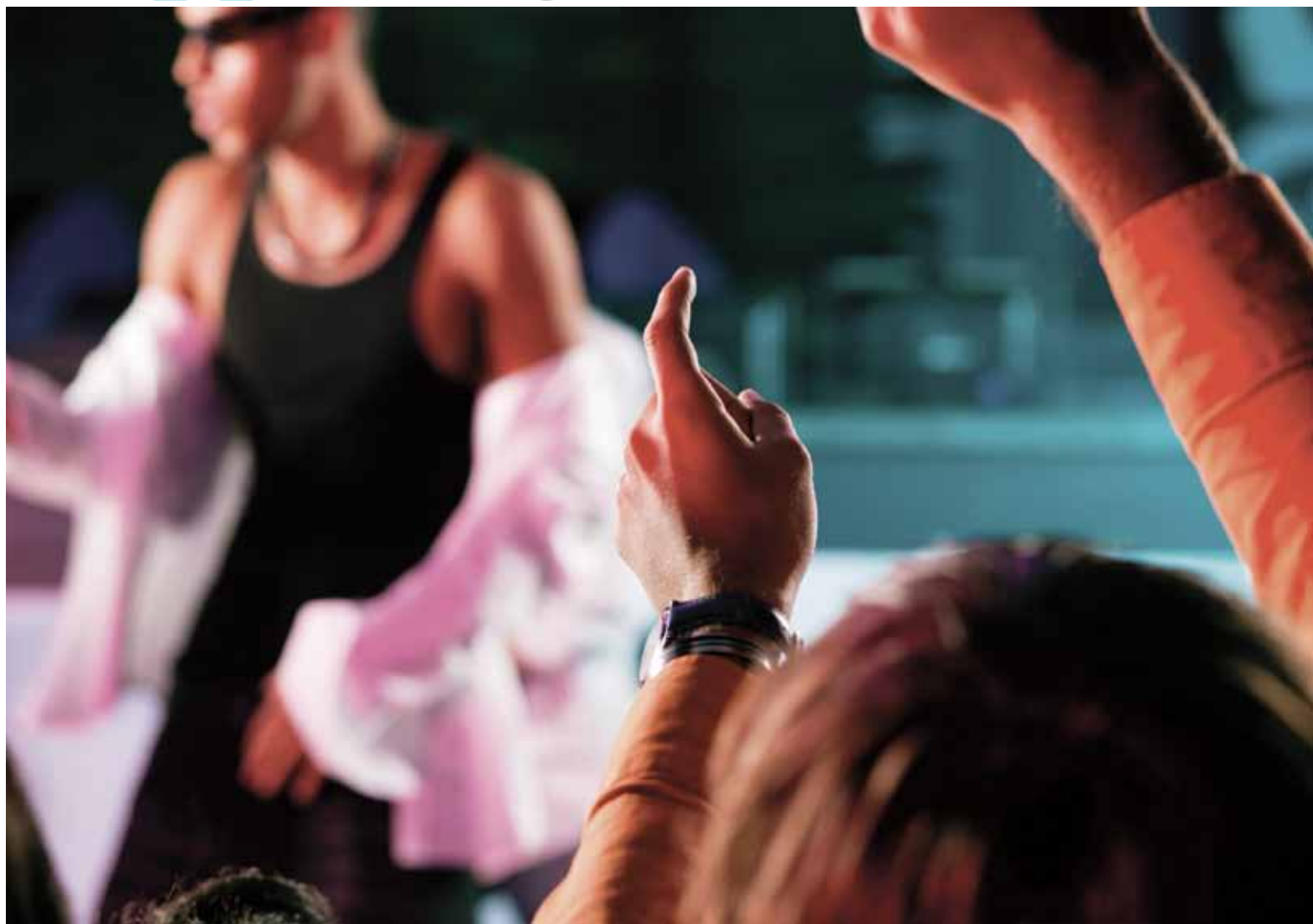
African Music and Dance Ensemble, Bellefield Hall Auditorium, April 20