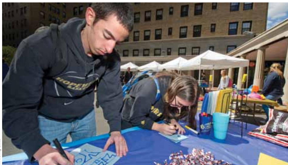
During Spring Fair 2012, Pitt students signed thank-you cards for the University's police officers as well as for the bomb-sniffing dogs used to search buildings during threats. The fair was held April 12 in Schenley Quadrangle.

Pitt's Student Government Board (SGB) has initiated two campuswide campaigns: "Keep Calm and Hail to Pitt" and "See Something, Say Something," designed to help empower students to report suspicious