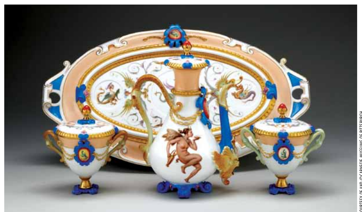
Carnegie Museum of Art, German Porcelain Service, Permanent Collection, ongoing