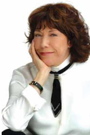
Lily Tomlin, Byham Theater, April 25

young Spanish nobleman, his lover, and their servants who are kidnapped and placed into a Pasha's service, April 28, May 1, 4, and 6 , Benedum Center, 237 7th St., Downtown, Pittsburgh Opera, 412-281-0912, www.pittsburghopera.org, PITT ARTS Cheap Seats, 412-624-4498, www.pittarts.pitt.edu.