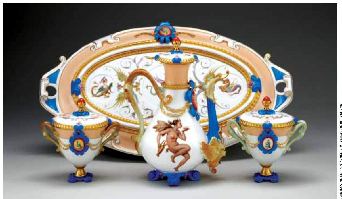
Carnegie Museum of Art, German Porcelain Service, Permanent Collection, ongoing